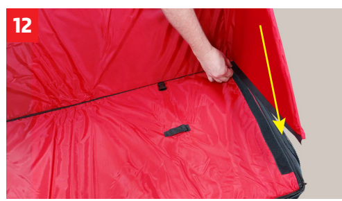
Next attach triangle top by lining up the velcro and securing it.