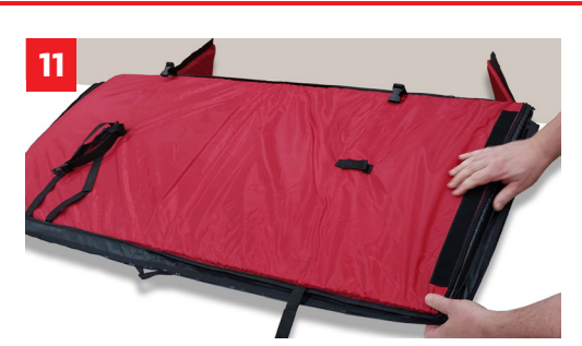
Repeat steps 9 & 10 on 2nd side of Bag Bunker™.