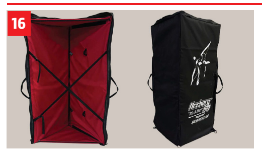
Now stand Bag Bunker<sup>™</sup> up and adjust straps if necessary. If straps do not make an "X" Bunkers will not stand properly. Repeat steps 2-15 for the remaining Bunkers.