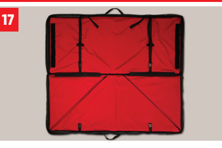
When finished playing and ready to store Bag Bunkers<sup>™</sup>, simply unstrap, and re-strap to the original clips and tighten straps