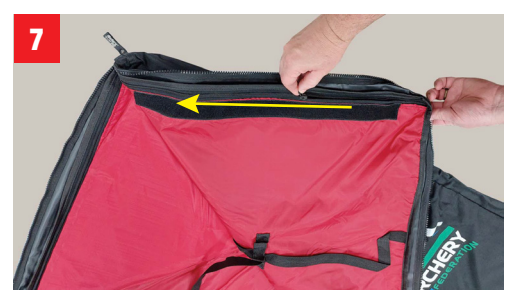
Unzip the tops of both sides of the Bag Bunker™.

Unfold and lay out Bag Bunker™ on a flat surface.