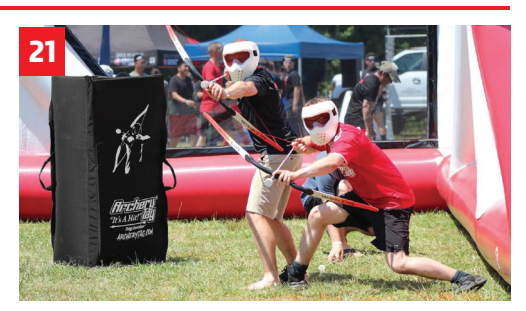
If using outdoors, anchor Bag Bunkers<sup>™</sup> by staking to the ground using the three "D" Rings.

This is the proper way to set up your Bag Bunkers<sup>™</sup> on an Extreme Archery field.