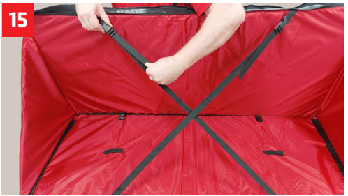
After attaching the second strap it should create and "X." Be sure straps are tight to give the most support.