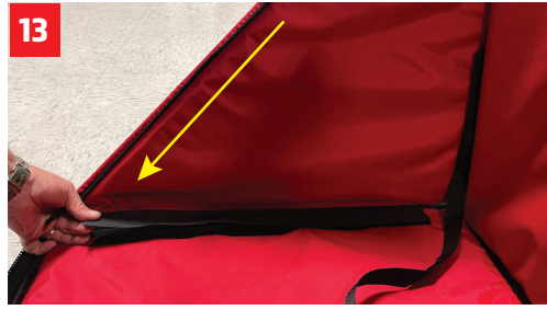
Repeat by attaching the triangle bottom using the velcro.