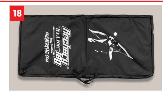
Fold triangle top and bottom inside, then fold Bag Bunker<sup>™</sup> in half and zip closed. Support Pads should remain inside Bunker.