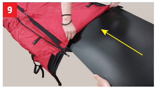
Slide an assembled Support Pad into the open bottom of one side of Bag Bunker™. Easier with two people.