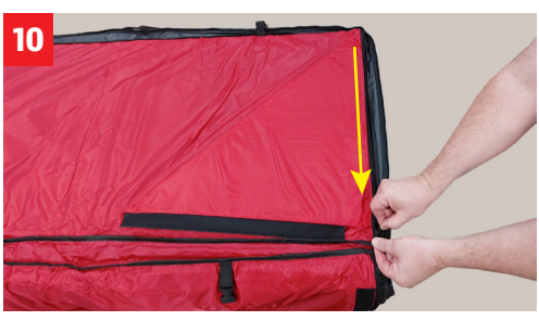
Zip the top of that side of the Bag Bunker™ closed.