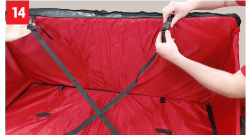
Now attached straps by criss crossing them for more support.