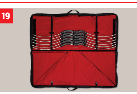
There are many storage uses for the Bag Bunkers<sup>™</sup>. One Bunker will hold up to 10 assembled bows.