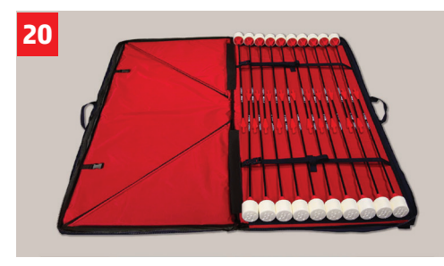
One Bunker will hold up to 24 arrows.