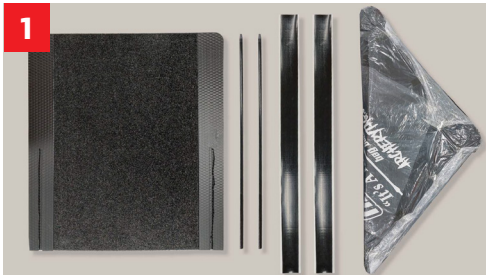
Contents: 6 - Bag Bunkers™ 12 - Support Pads (2 each) 24 - Support Rods (4 each) 24 - Adhesive Strips (4 each)