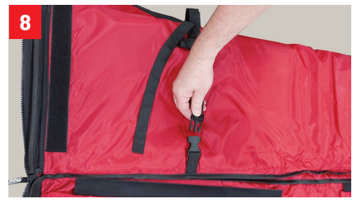
Open Bag Bunker<sup>™</sup> red side up. Unclip both straps.